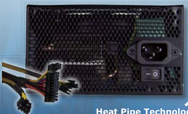
Heat Pipe Technology