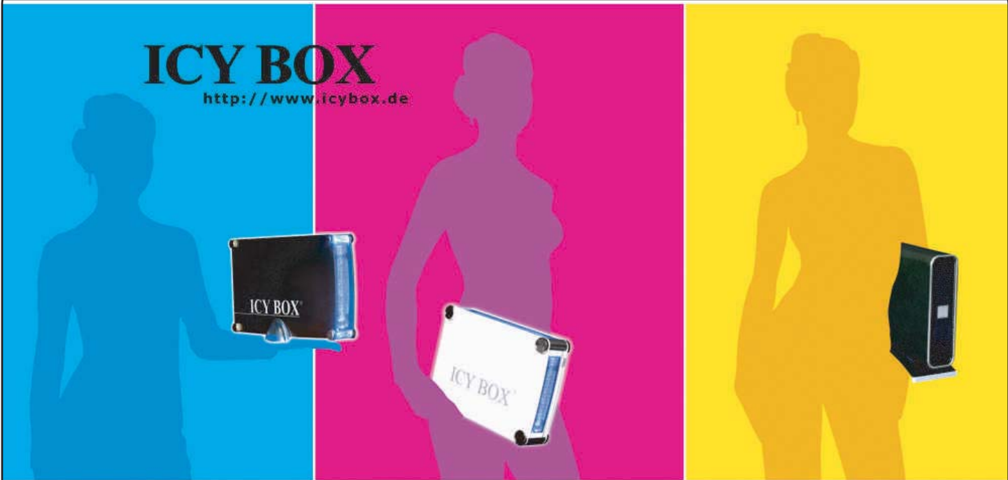
ICY BOX IB-351B-BL