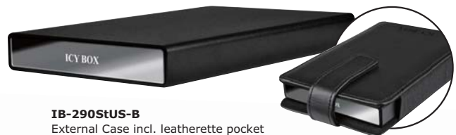
IB-290StUS-B External Case incl. leatherette pocket